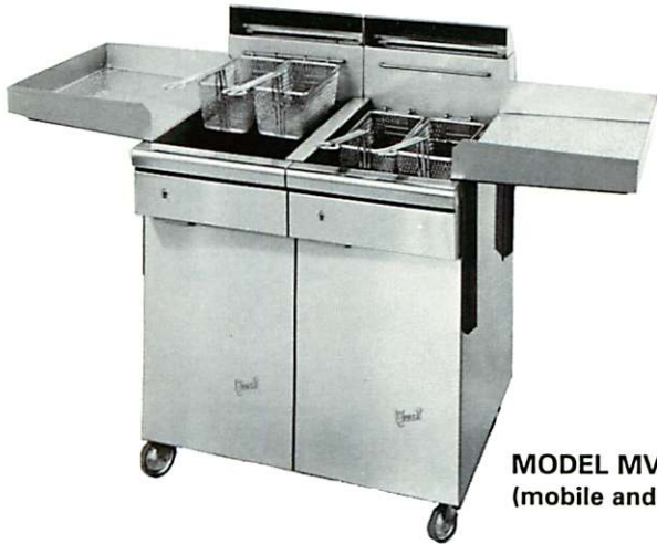
MODEL MV40 (mobile and c/w drain shelves)

Options available include mobility on casters, filter systems and drain shelves – all at minimal extra cost.