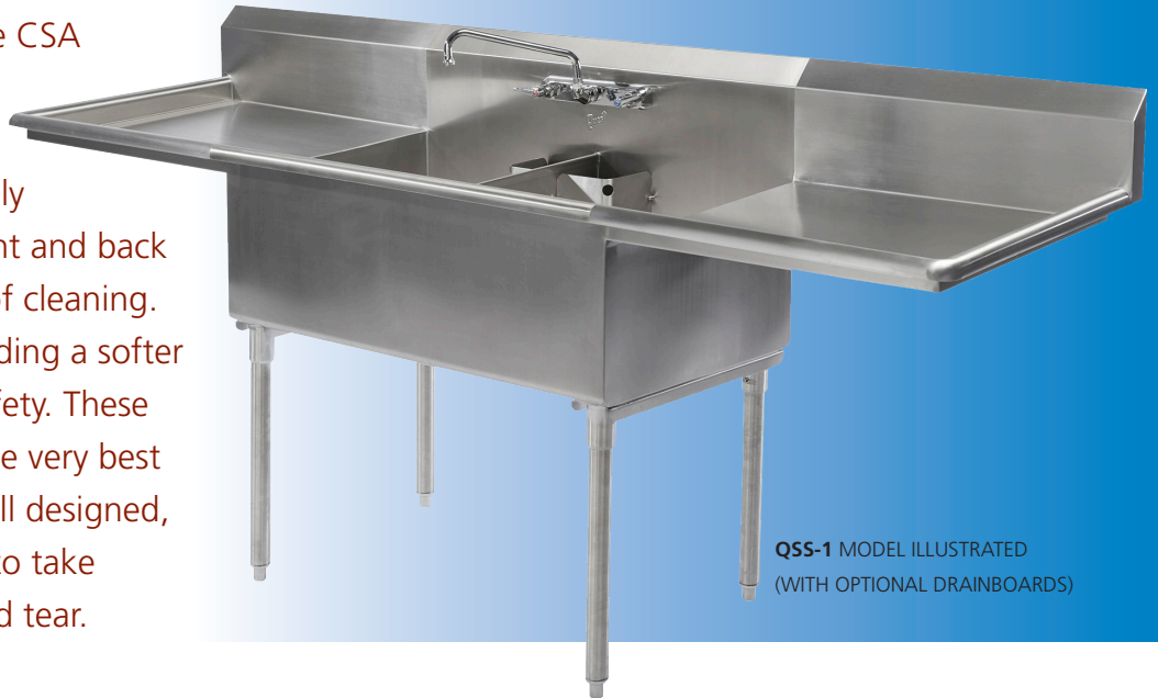
QSS-1 MODEL ILLUSTRATED (WITH OPTIONAL DRAINBOARDS)

QUEST standard sinks are CSA approved and fabricated from T304 stainless steel. They are functionally designed with radius front and back compartments for ease of cleaning. Top rims are rolled, providing a softer edge for comfort and safety. These standard sinks provide the very best quality and value in a well designed, sanitary sink, fabricated to take unusually heavy wear and tear.